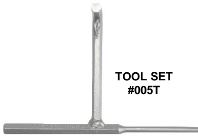
TOOL SET #005T